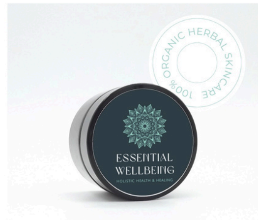
'ESSENTIAL HEALING BALM'