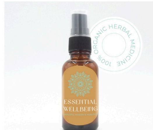
'BRAIN BOOST TINCTURE'