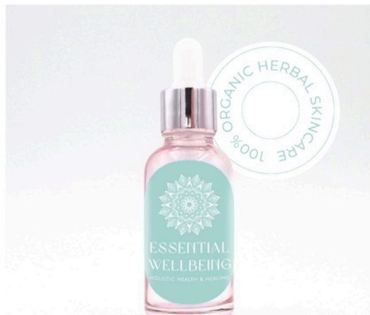
'SKIN RENEW SERUM'